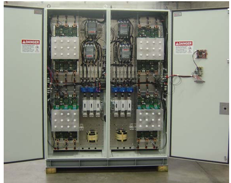
1/2 MW Energy Recovery Converter