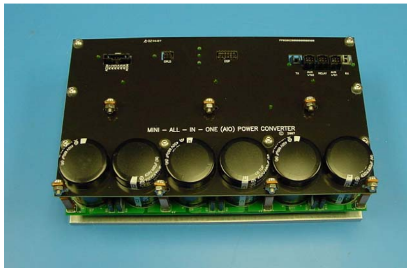
20 kW Mini AIO