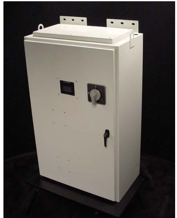
Solindro TM 100 kW Converter